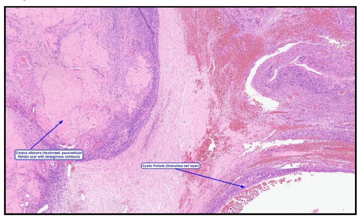
Figure 3: Histology slide of corpus albicans and adjacent cystic follicle